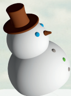
1 Snowman meeple